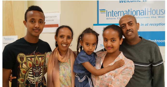
A family who fled their native country as refugees was reunited thanks to legal assistance provided by The Ginter Immigration Law Clinic at International House in Charlotte.